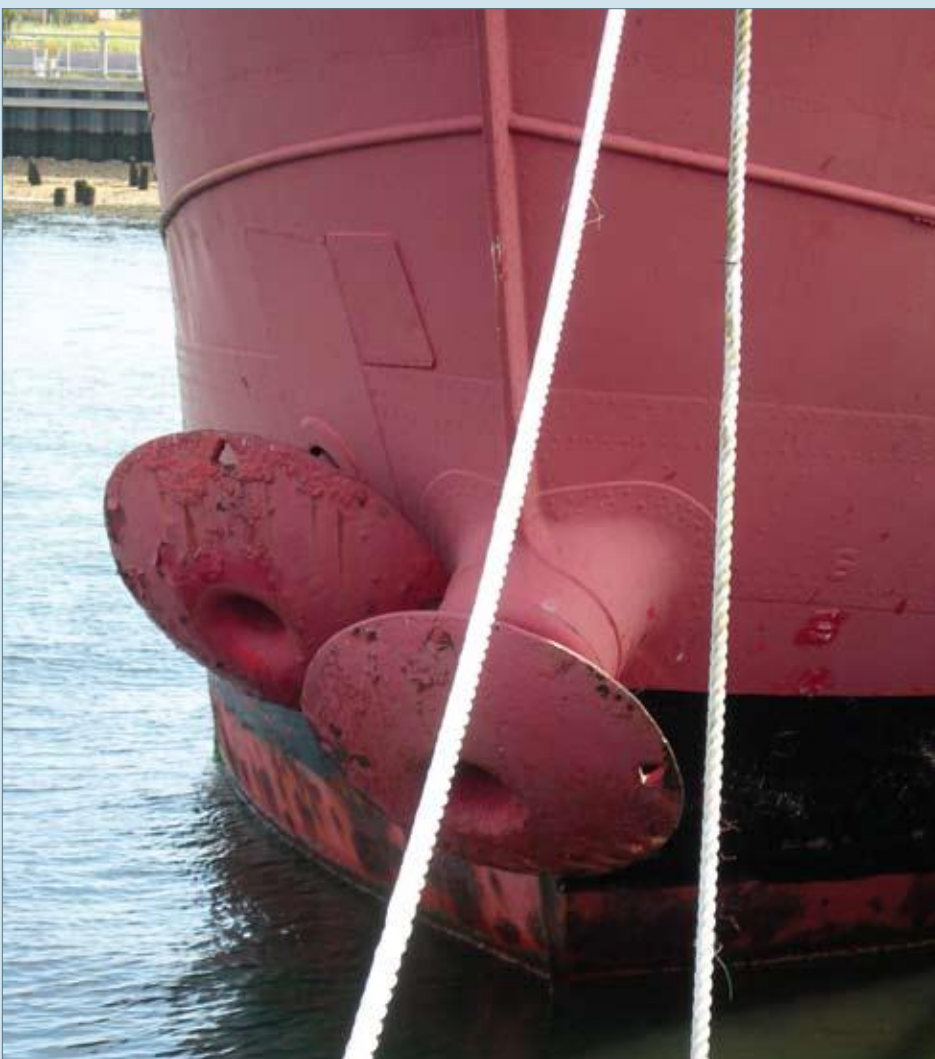
■ (Above left) The pilot house of the LV-112 as it appeared in 2010. (Above right) LV-112's main engine room in 2010. The main engine is on the right and yellow fuel, orange lube oil, and transfer/system valves are visible. (Left) The 7,000-pound main and 5,000-pound auxiliary mushroom anchors that held the LV-112 on station off Nantucket Shoals.

stack, extinguishing the fires in the engine's boilers. Her famous lights went out, and the foghorn was silenced. LV-112 's two helm stations, one in the pilothouse and the other on the flying bridge, were destroyed. The oncoming seawater penetrated and short-circuited the electrical systems, causing fires to break out throughout the ship. Seawater surged