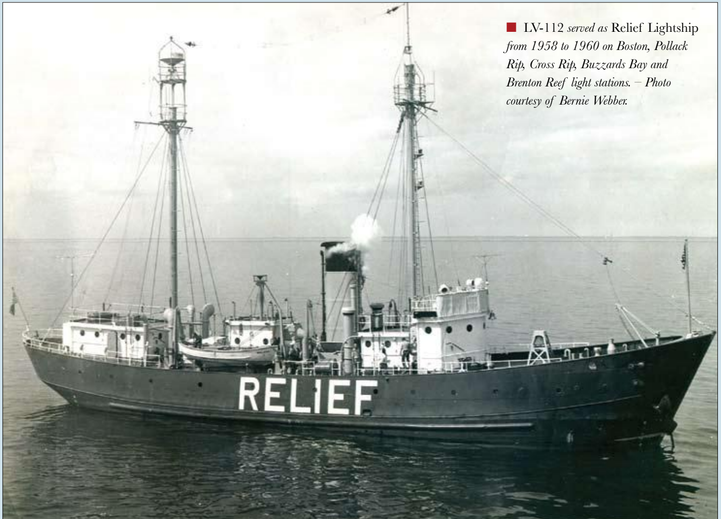
■ LV-112 served as Relief Lightship from 1958 to 1960 on Boston, Pollack Rip, Cross Rip, Buzzards Bay and Brenton Reef light stations.

“ THERE WERE MANY STORMS and hurricanes,” Gubitosi continued. “One scary night, we broke our anchor chain and did not know it. We wound up off the coast of New Jersey the next day with our radio beacon still going. I remember going on the bridge that night and watching the ship through the porthole, going up walls of water that looked like five- to ten-story buildings, then taking a nose dive straight down. The most pleasurable times were when the mail came, the few calm summer days without the fog horn, the fishing, watching the aurora borealis and the sea life.”