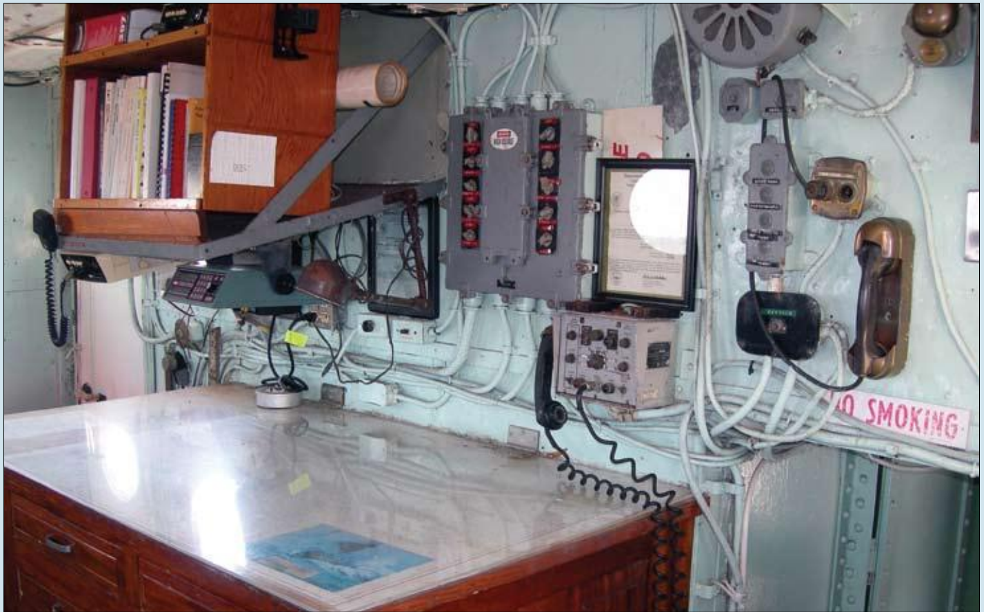
■ (Above) The chart table and ship's communication systems in the pilot house in 2010. (Facing page) The crew's mess on LV-112 as it appeared in 2010.

temperature and wave heights. In addition, selected lightships made and reported oceanographic observations. These varied between locations but usually included sea water samples and subsurface temperature measurements. On the East Coast these were coordinated by the Woods Hole Oceanographic Institution on Cape Cod.