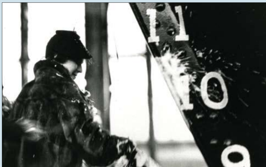
■ (Above) LV-112 , being christened at a launching ceremony in Wilmington, Delaware, 1936. (Below) LV-112 en route to her station on the Nantucket Shoals .

MOST LIGHTSHIPS included a crew of approximately 12 sailors. Nantucket Lightship / LV-112 was designed and built to accommodate 21 sailors. However, its crews were mostly around 17 including 14 enlisted sailors and three officers. Most lightship sailors served four to six weeks on station and would go on leave ashore for two weeks at a time. The weather also