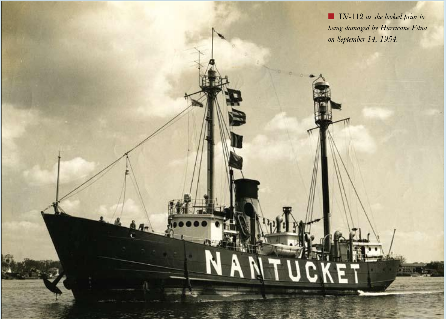
■ LV-112 as she looked prior to being damaged by Hurricane Edna on September 14, 1954.

movies, etc. Shark fishing was a favorite and risky activity. Blue sharks were common and plentiful. It was not uncommon to catch up to 15 sharks in one day that averaged six feet in length. They were usually thrown back in the water alive. During the Cold War days, it was fairly common to spot Russian trawlers nearby. In fact, Russian and LV-112 crewmembers occasionally had encounters and traded items such as cigarettes, fish, trinkets, and the like.