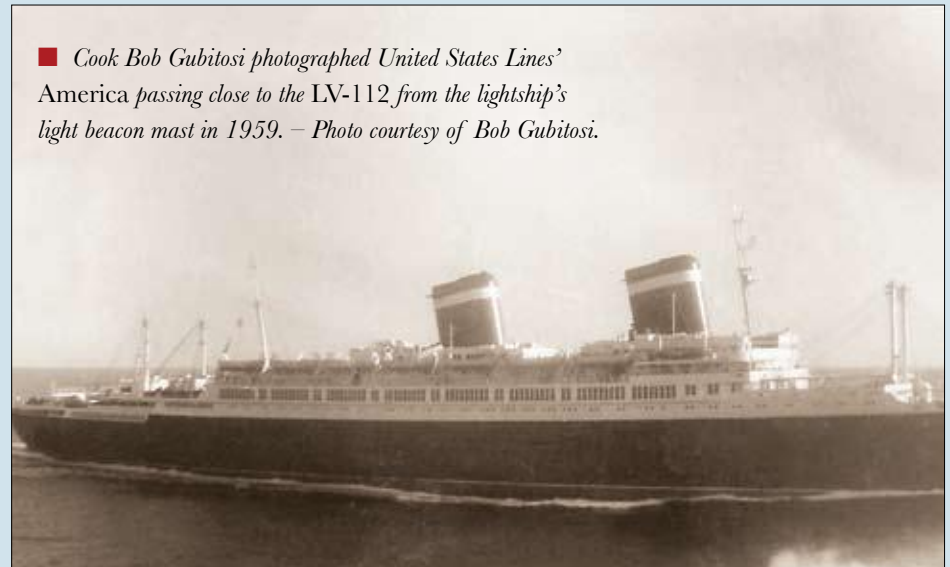
■ Cook Bob Gubitosi photographed United States Lines' America passing close to the LV-112 from the lightship's light beacon mast in 1959.

RAGING STORMS could last for days, with waves breaking over the bow. As the bow rose up from under its enormous weight, tons of water would wash down the deck and off the stern. Then the bow would be buried under the next wave, and the procedure would repeat itself over and over again. On the first day, everyone would continue to eat, and the cook would place a dampened tablecloth on the mess deck table to keep plates and food from sliding off. As the storm continued, fewer crewmen would be taking their meals; they would switch to apple and saltines. If the storm was violent